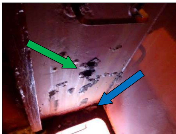
Figure 2: Broken stopper (green arrow) and broken hinges (blue arrow)

An inspection of the cargo hold access cover indicated it was also designed to help a person climb the vertical ladder. A stopper pin was fitted to keep the cargo hold access cover secured and in a vertical and open position. The MSIU found that the cargo hold access cover's stopper pin had been totally dislodged and the hinges had failed (Figure 2), in all probability while the stevedore was climbing out of cargo hold no. 2 5 .