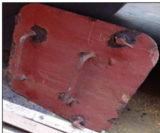
Figure 3: Cargo hold access cover as found at the bottom of the cargo hold.

The cargo hold access cover had signs of general corrosion. Material wastage was evident, suggesting that it had not been maintained over the months prior to the accident (Figure 3).