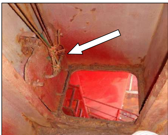
Figure 5: Cargo hold access cover in way of cargo hold no. 4

An additional cargo hold access cover was inspected during the course of evidence collection on board. The cargo hold access cover fitted in cargo hold no. 4 was found in a similar (poor) condition to that in cargo hold no. 2 (Figure 5).