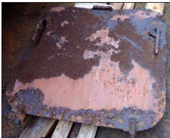
Figure 4: Material wastage signs and failed of hinges

It was clear to the safety investigation that the hinges and stopper failed while the stevedore was climbing his way up from the cargo hold. Moreover, the most logical sequence of events was for the stopper pin to fracture first, followed by the hinges (unless the hinges had already corroded away prior to the accident).