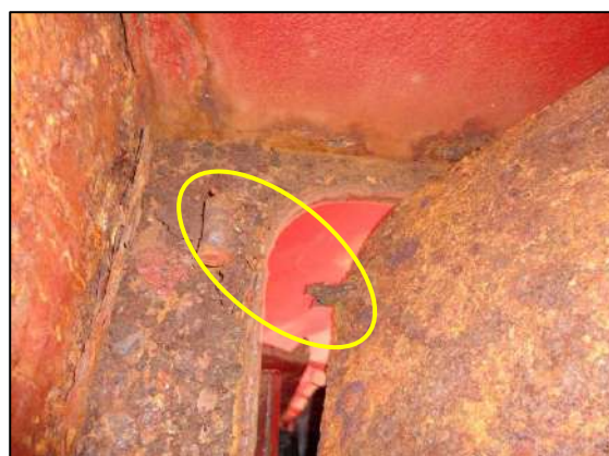
Figure 6: Broken hinge

Taking into consideration the condition of all the inspected cargo hold access covers, the safety investigation concluded that the covers had not been thoroughly inspected as part of a maintenance regime applied on board and may have even been missed, given that they were rarely used and always kept in the open position.