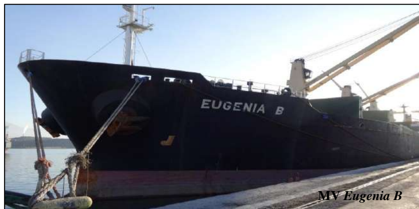
MV Eugenia B

The MSIU has issued recommendations to the flag State Administration and the Company designed to ensure that the company addresses the maintenance of critical fittings inside the cargo holds of vessels under its fleet.