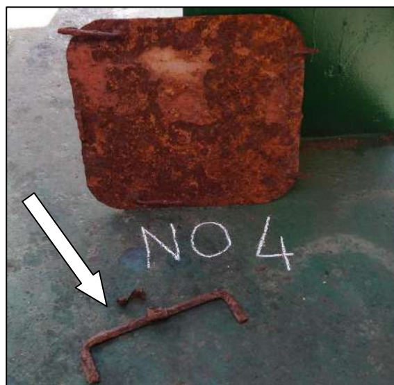
Figure 7: Broken stopper

Considering that the use was very limited and taking into consideration that there was no thorough knowledge of the physical condition of the grain hatch cover, the safety